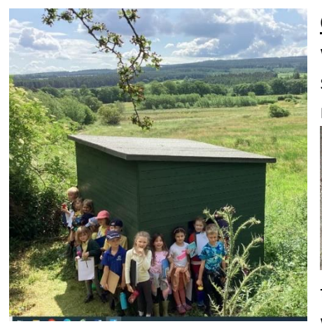
Class 1 have been looking at the local birds that live and visit our woodland area, creating some artwork in the style of Andy Goldsworthy, using found natural materials to create images of these.