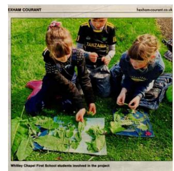
Pupils help protect wildflowers in long-term project

<u>Class 2</u> as you read above have been exploring, and protecting, the wild flowers in the verges, and work has been done in a number of sessions. And they even appeared in the Hexham Courant over the half term break – did you read it?